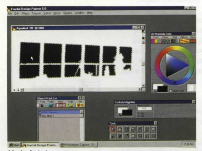
Mask of window scan